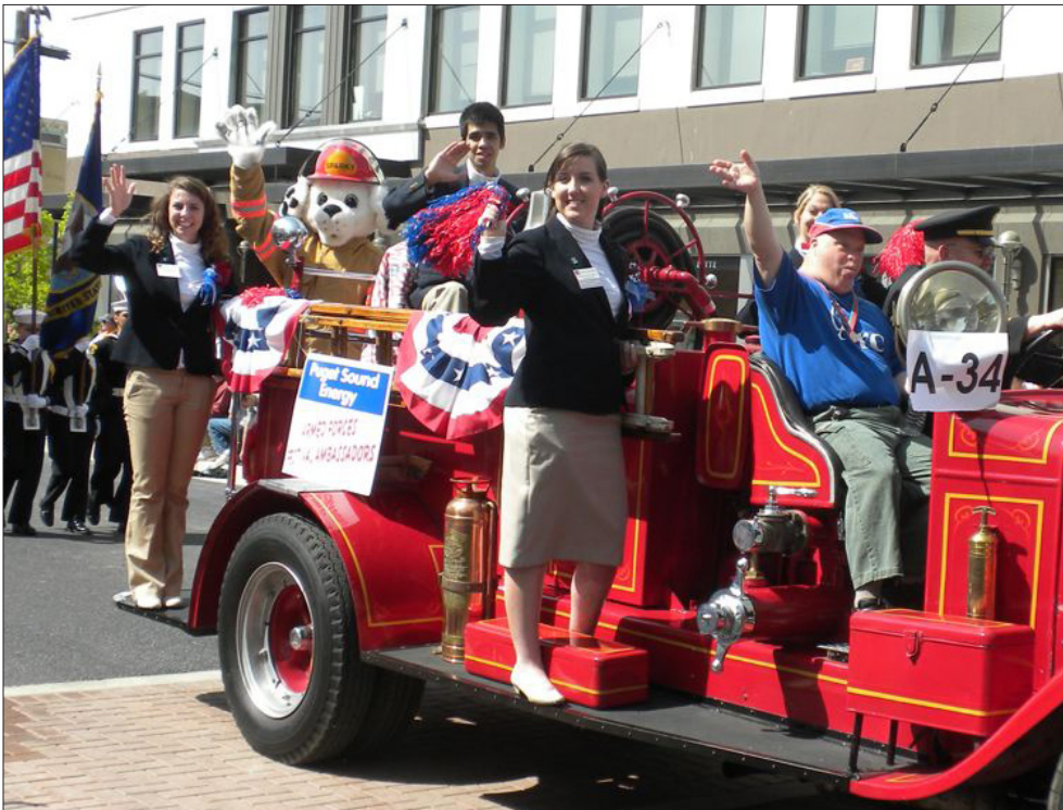
The young Armed Forces Ambassadors are smiling and waving as they enjoy their ride in the 1931 Bremerton Fire truck. Our Council is the proud sponsor of one of these fine young people and we wish them well as they head for college this fall.