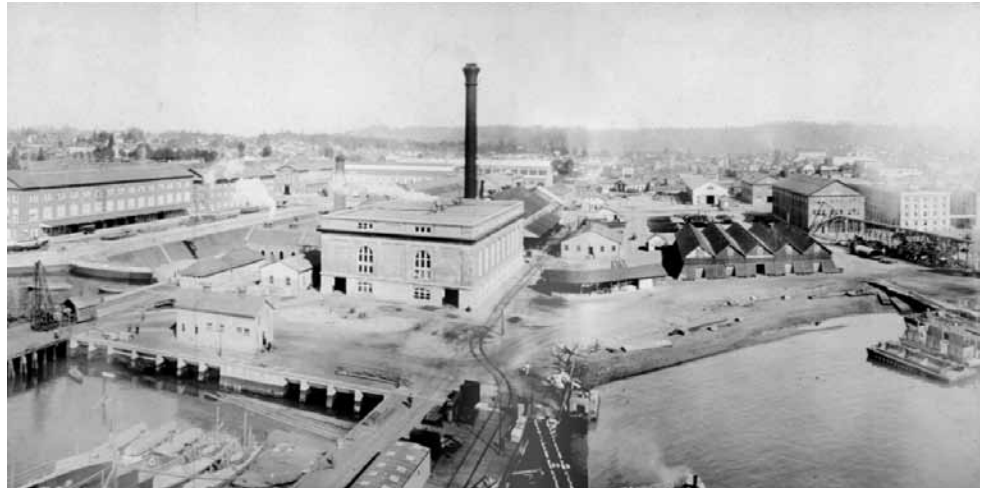
The Puget Sound Naval Shipyard in 1913.