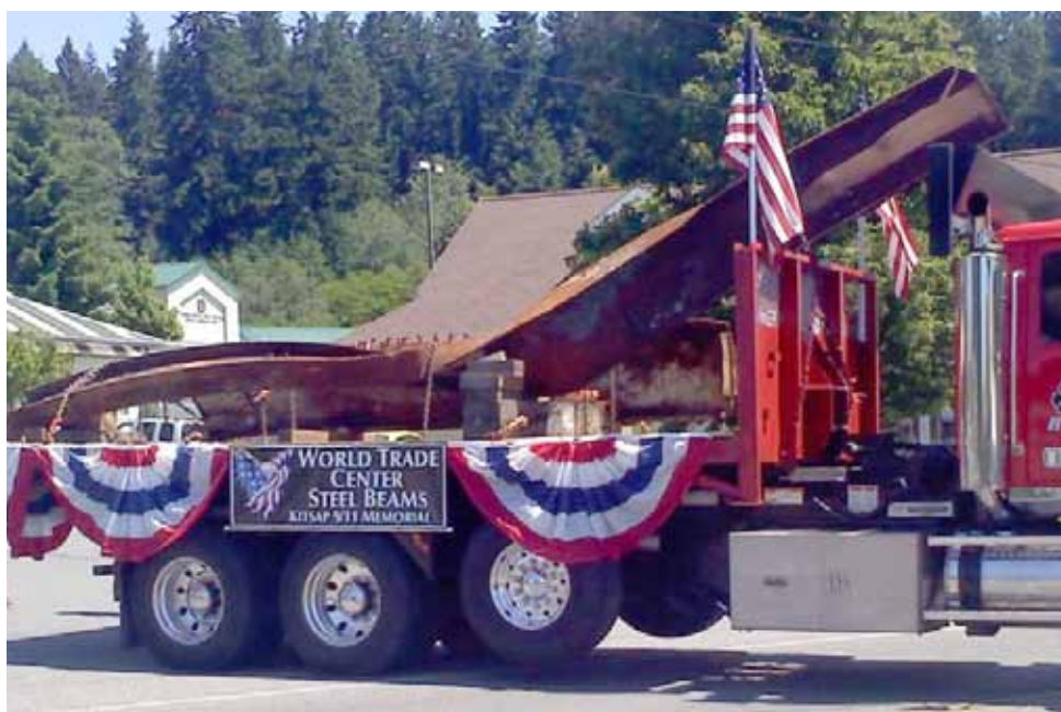
WTC beams arriving in Western Washington

If you have not taken time to walk down to the breakwater at the Bremerton Harbor to see the Lone Sailor up close, plan to do so as soon. It is a great photo opportunity.