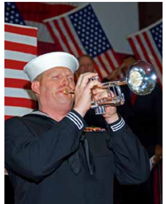
Photos by Ted Moore, Gold Wing Road Riders Motorcycle Club, Chapter "B".