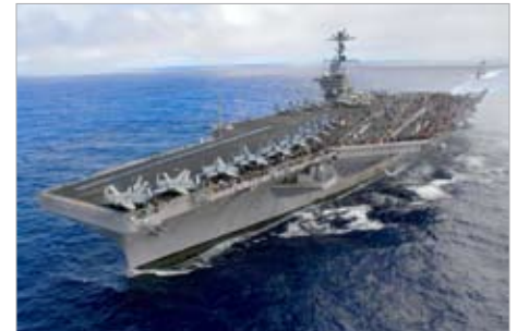
USS John C. Stennis (CVN 74) leads guided-missile cruiser USS Antietam (CG 54) prior to conducting an air power demonstration. The air power demonstration showed the capability of Stennis and Carrier Air Wing 9 to the onboard Tigers. (See insert for more Tiger photos)