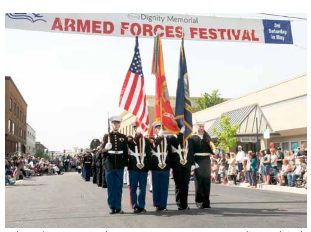
Sailors and Marines assigned to Marine Corps Security Forces Battalion march in the 62nd annual Dignity Memorial Armed Forces Day Parade