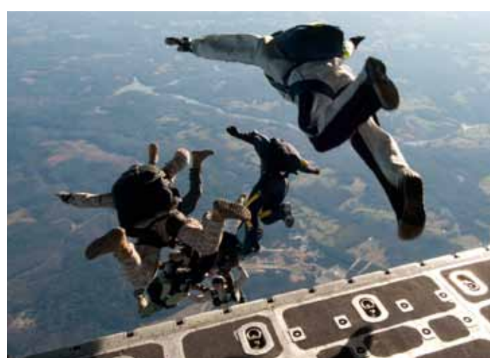
U.S. Navy SEALs exit a C-130 Hercules aircraft during a training exercise.