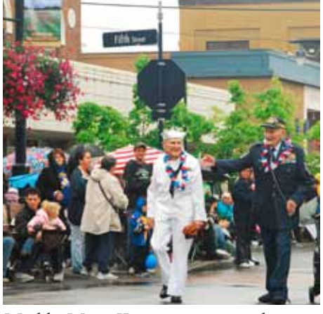
World War II veterans march past the parade judges stand in the 63rd annual 2011 Armed Forces Day Parade. The parade began in 1948, two years before Armed Forces Day became a federally recognized holiday. Thousands of spectators viewed more than 150 marching units, dozens of military entries and several marching bands. The parade is the nation's largest and longest-running Armed Forces Day Parade.