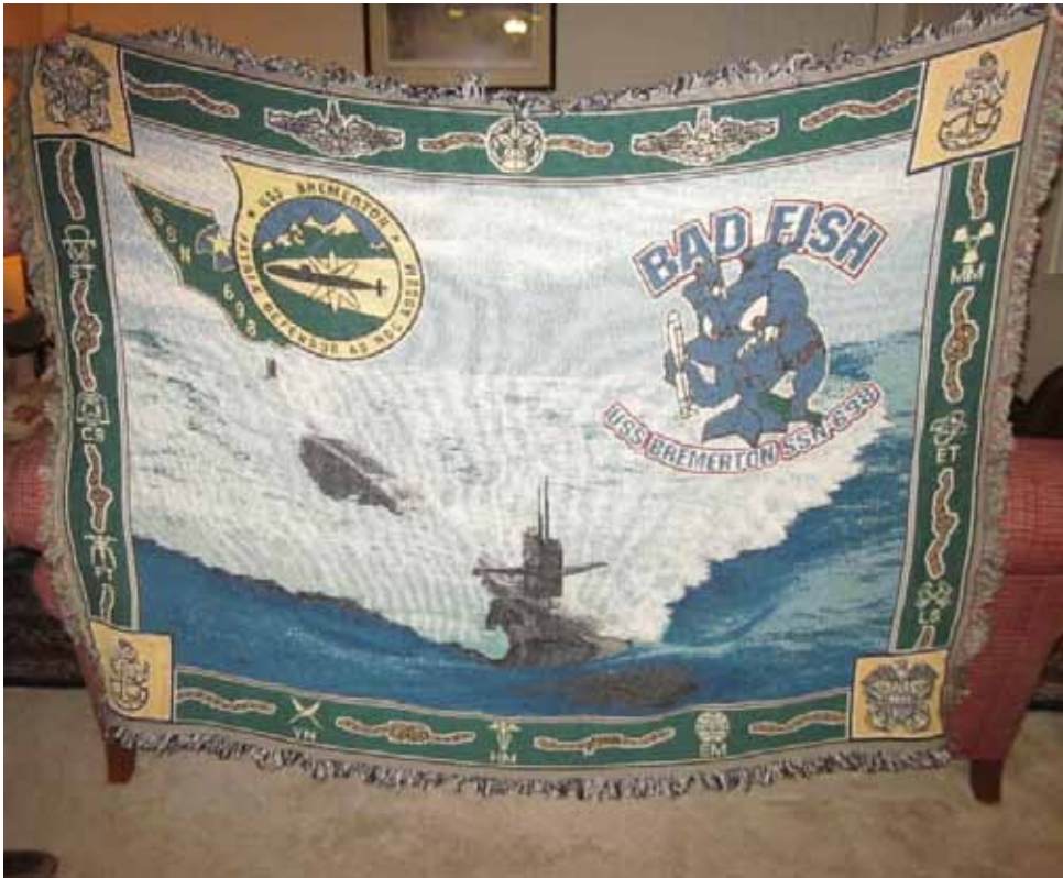
Proceeds from the sale of these throws have been used to provide special treats for the crew of the USS Bremerton.