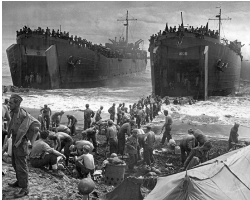
U.S. landing ships, tank (LSTs), on the beach at Leyte Island in the Philippines, October 1944.

While the powerful US Navy held all the cards in recapturing the Philippines at Leyte, the Japanese, with a strong surface force, had a very aggressive defensive plan, which coupled with some poor