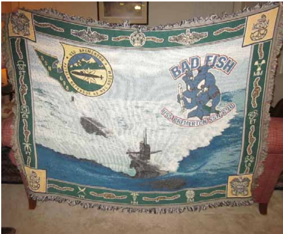
Proceeds from the sale of these throws have been used to provide special treats for the crew of the USS Bremerton.