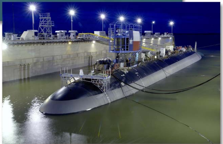
Top: Artist's rendering of a Virginia Class Submarine firing a MK48 Torpedo. Courtesy Northrop Grumman Corp. Bottom: The floating dry dock holding Texas slowly fills with water before the submarine is launched into the James River on April 9. Once in the water, tugboats moved Texas to Northrop Grumman shipyard's submarine pier, where final outfitting and testing will take place. Photo by Chris Oxley