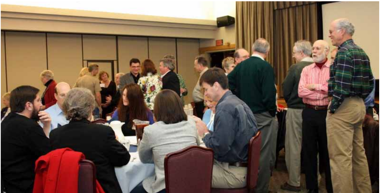
Navy Leaguers enjoying a monthly lunch with good food and conversation