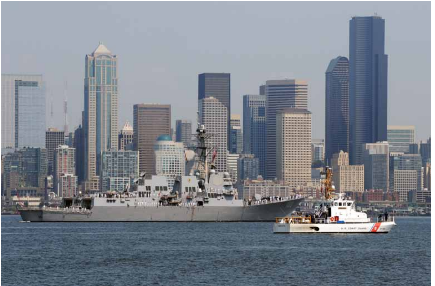
The Arleigh Burke-class guided-missile destroyer USS Kidd (DDG 100) arrives in Seattle last year, to participate in the 61st annual Seattle Seafair Navy Week.