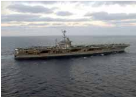
USS John C. Stennis