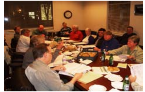
Board members get down to business