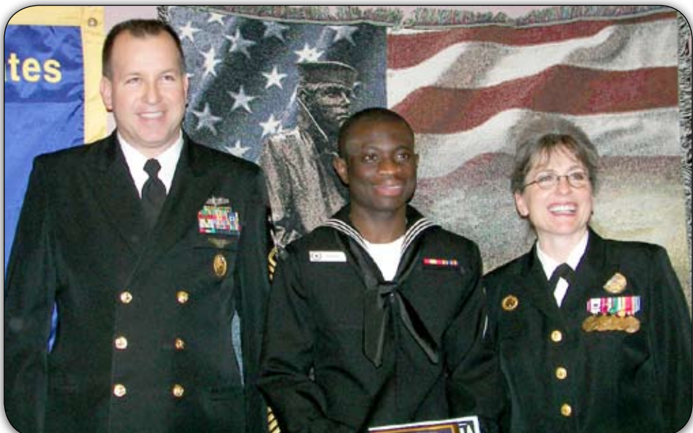
League of the United States N I Society of the United States RETOR OL