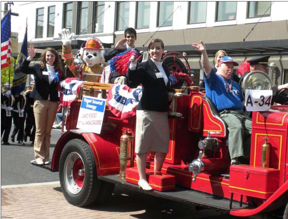
The young Armed Forces Ambassadors are smiling and waving as they enjoy their ride in the 1931 Bremerton Fire truck. Our Council is the proud sponsor of one of these fine young people and we wish them well as they head for college this fall.