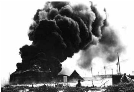
Burning oil tanks on Sand Island, Midway, following the Japanese air attack