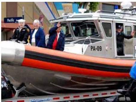
Board members and a Sea Cadet ride a SAFEBOAT in the 63rd Armed Forces Festival Parade with more than 20,000 people celebrating our military.