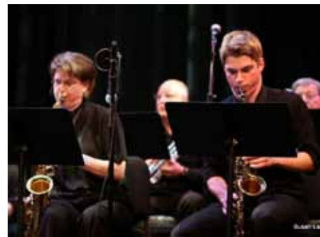
Swing Fever's 12 piece band provided great music for the Navy League Gala participants.