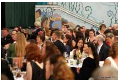
This year we were delighted to host and honor more than 160 military and their spouses at our annual Gala held at the Admiral Theatre in downtown Bremerton.