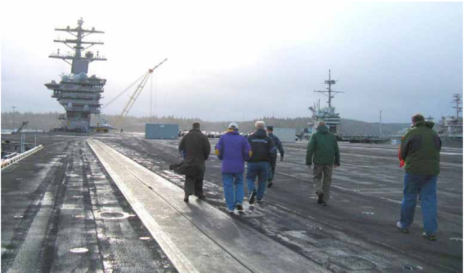
Navy Leaguers onboard the flight deck of USS Stennis

Her telephone number is 360 373-1035 x221. Her office is right on the Boardwalk at 120 Washington Beach in Bremerton.