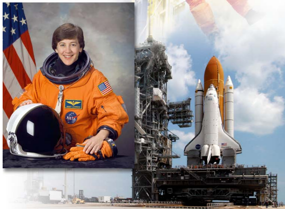
Above Left: Mission specialist Wendy Lawrence will join six other astronauts onboard the shuttle Discovery for the "Return to Flight" mission scheduled in July. Right: The Shuttle Discovery upon its arrival at Launch Pad 39B following its move from the Vehicle Assembly Building.