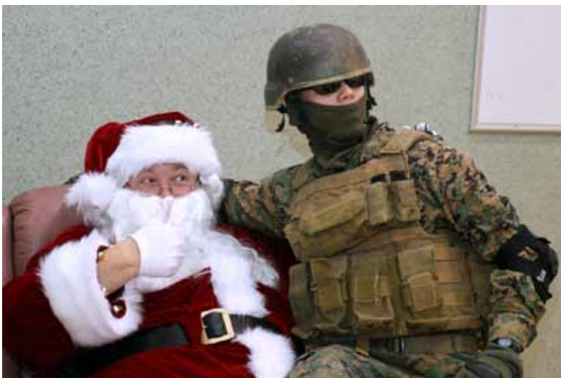
Everybody loves Santa

Our council would not be able to participate in such events if it were not for the generous support of our members. We especially would like to thank TriWest Health Care Alliance for their generous donation to our Operation Holiday Spirit projects this year.