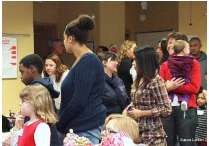
Santa and his elves bring smiles of joy to the children of Individual Augmentee families

This year, our council participated in several events to brighten the holidays for some of our military families. All of the events are fun and worthwhile, but the smiles on the faces of children and parents at the Individual Augmentee Holiday party were especial-