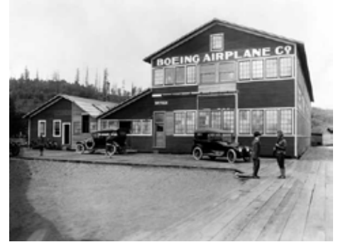
The Red Barn during World War I and how it looks today.