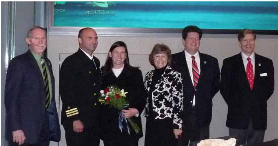
Mayor Lent and City Council members