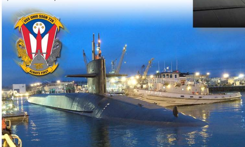
Above: The guided missile submarine USS Ohio (SSGN 726) is gently pushed to the pier by a tugboat as it returns to Puget Sound Naval Shipyard and Intermediate Maintenance Facility in Bremerton, Wash., Dec. 19, 2005, after completing sea trials. Above Right: USS Ohio prepares to stop for a personnel transfer in Puget Sound. Media were transported to Ohio to see the new capabilities that the submarine now brings to the joint warfighter.

Due to its size and layout, SSGNs offer expanded living and training space for embarked SOF, including increased bunk capacity and improved training and physical conditioning areas that allow the SOF operators to maintain their high operating capacity. Another advantage of SSGNs' size will be its ability to carry an increased payload that will allow for the launch and recovery of unmanned undersea vehicles. As new capabilities and equipment are developed, they can be inserted relatively easily into SSGNs thanks to its open architecture computing systems and the related ability to rapidly integrate new technologies and payloads. SSGN can