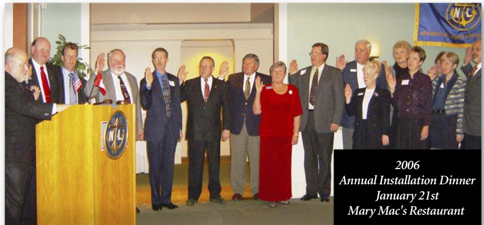
2006 Annual Installation Dinner January 21st Mary Mac's Restaurant