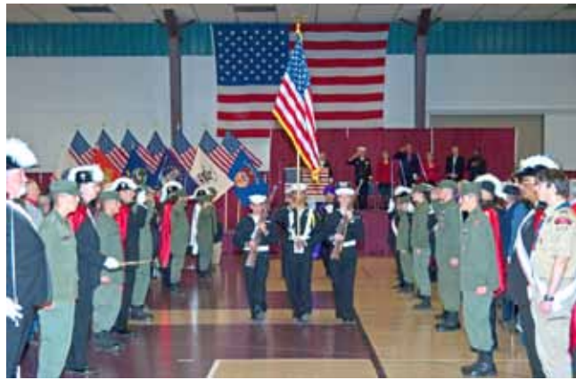
Kitsap Battalion Sea Cadets join with the Knights of Columbus and the Washington Youth Academy in Parading the Colors at our Veterans Day program.

The photos help tell the story of the day as over 1400 people participated in the event.