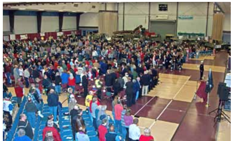
Hundreds turn out to honor our veterans at the Kitsap Sun Pavilion Fairgrounds on Veterans Day.