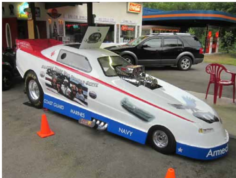
Racing Car from the My Girl Museum in Kingston