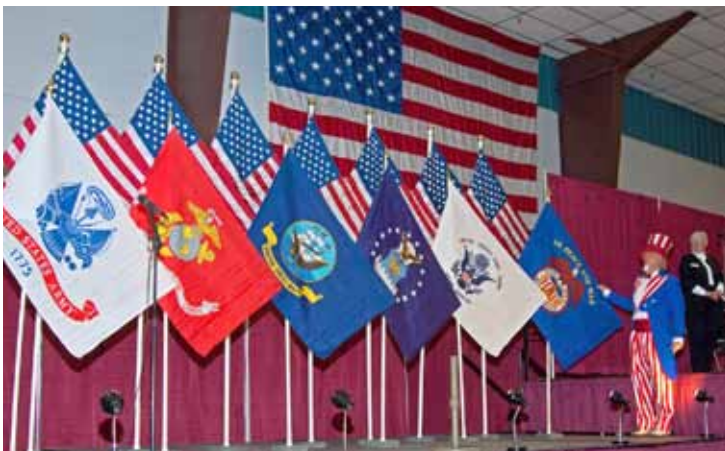
Uncle Sam admires LeMoyné Jevne's flag display at the Veterans Day Program.