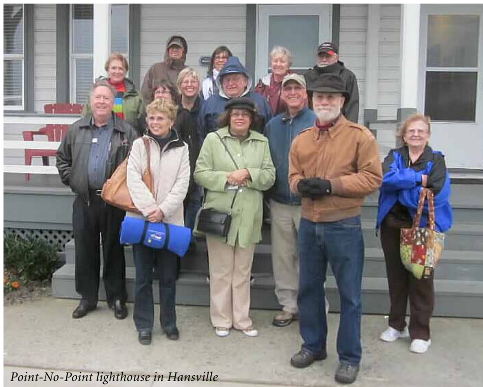
Point-No-Point lighthouse in Hansville