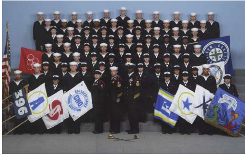
Recruit Training Command's "Inaugural Mariner Company"

On October 19, 2008 at Recruit Training Command in Great Lakes, IL 88 Sailors from NRD Seattle's "Inaugural Mariner Company" graduated from Bootcamp. These 88 Sailors were now formally known as the inaugural "Mariner Company." The Company spent the next seven weeks training from civilian to Sailor under the watchful eye of their Recruit Division Commanders. Training included: formal classroom instruction, airplane, helicopter and ship identification, Basic Damage Control, Seamanship, Naval History, and of course Navy Core Values - Honor Courage and Commitment.