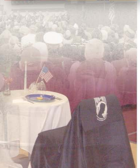
Veterans Day Ceremony