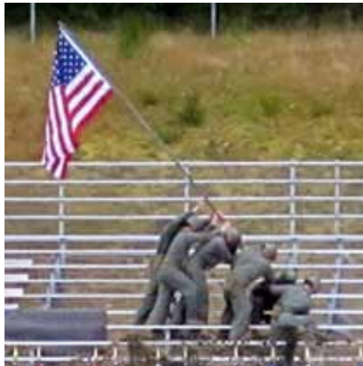
One of the highlights of the parade is the reenactment of Raising the Flag at Iwo Jima.