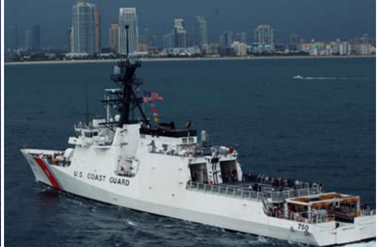
USCGC BERTHOLF showing the two helicopter hangers and rear launch ramp door.