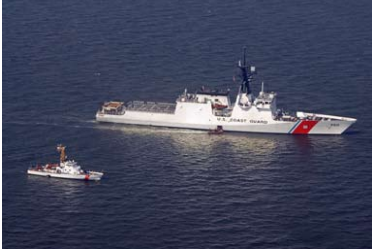
USCGC STATEN ISLAND and the USCGC BERTHOLF