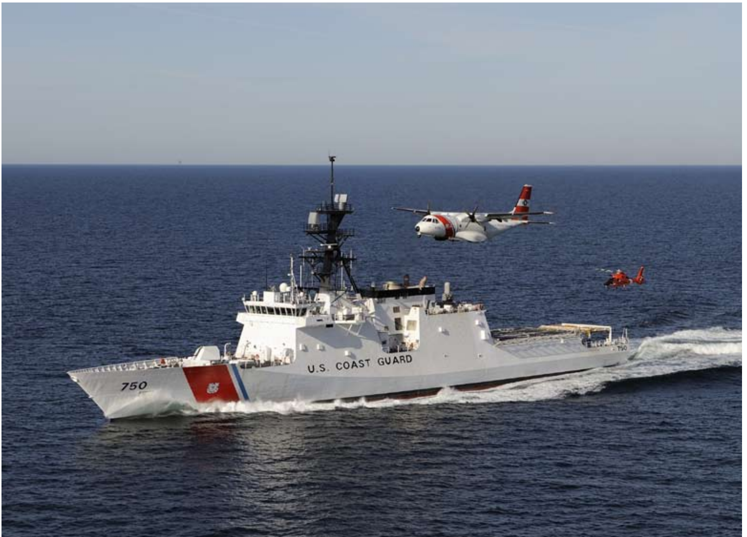
USCGC BERTHOLF operating in concert with the services new maritime patrol aircraft, the Ocean Sentry HC-144 and a newly re-engined HC-65 helicopter.