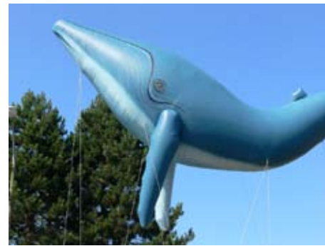
The Whaling Days Balloon flies high over the Navy League float during the Whaling Days Parade. Thanks, Louis Mejia, for all of your efforts in keeping our float "afloat."