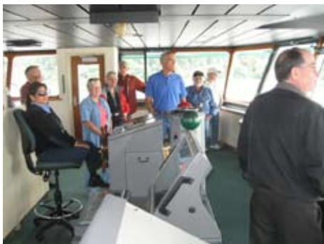
Council members enjoy the tour of the Bridge on the Bainbridge to Seattle Ferry during a recent event put together by Trips and Tours Committee.