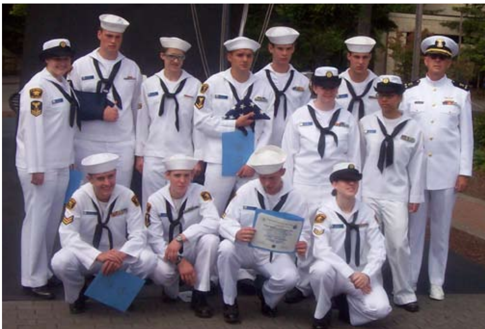
Petty Officer Leadership Academy Class of 2008 – NBK, Bangor