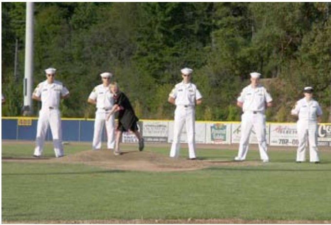
Petty Officer Leadership Academy Blue Jacket's Baseball Game

U.S. Naval Sea Cadets from across Washington, Oregon and California came together on July 10th for the Petty Officer Leadership Academy (POLA), Class of 2008, held at the Center for Naval Leadership at the Trident Training Facility, Bangor. Cadets were exposed to a broad spectrum of leadership related skills and had the opportunity to practice those skills