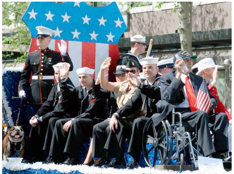
Waving to the crowd at the Armed Forces Day Parade

Thanks to all of the sponsors and to the members of the Military Affairs Committee who work on this event all year long in honor of our military.