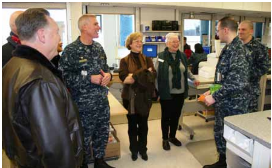
NHB Tour group is thoroughly enjoying hearing the stories of these fine young men as we tour the hospital