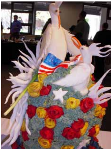
Armed Forces Festival Activities. Military Chefs Competition on May 14, 10 am to 2 pm at Olympic College