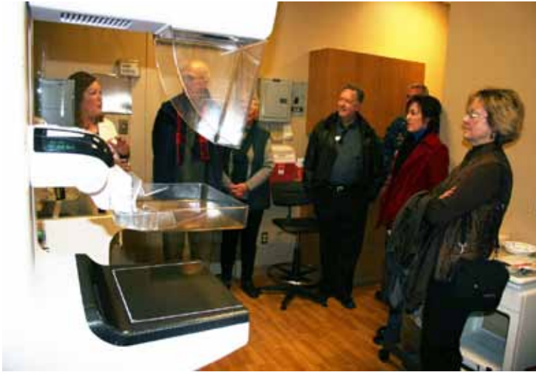
NHB Tour group getting briefed on the newest state-of-the-art mammography machine in the Puget Sound area