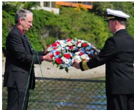
Memorial Day Wreath offered in 2009

Respectfully submitted, Gary S Gunderson