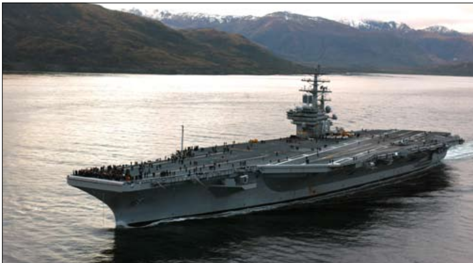
USS REAGAN Transits Straights of Magellan