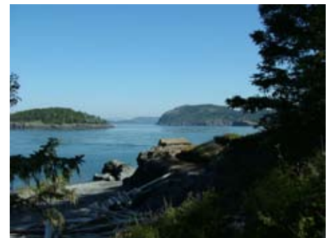
Beautiful Oak Harbor – the location for the Navy League NW Regional Conference.