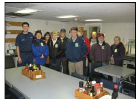
Navy League members and guests enjoy the hospitality of the McArthur 2 and the Okeanus Explorer in Seattle on March 14th