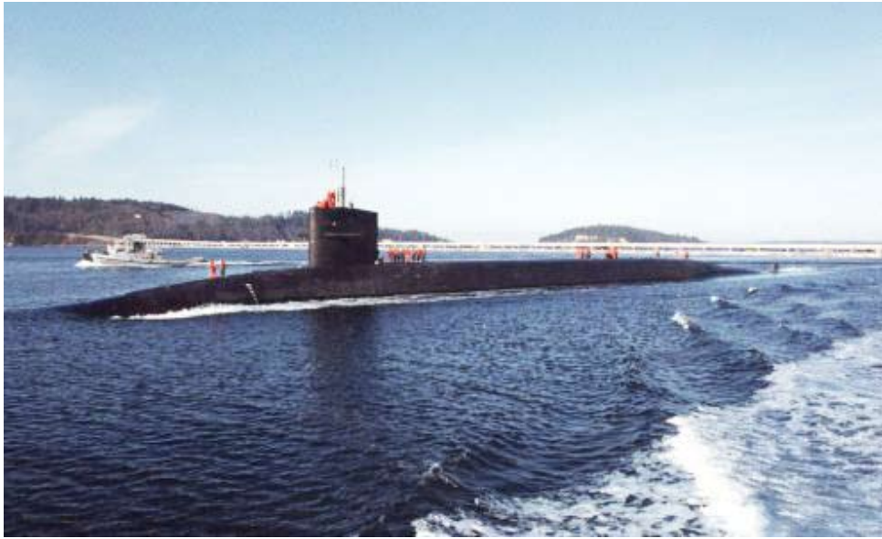
The USS Ohio (SSBN-726), just having passed through the Hood's Canal floating bridge and heading south, circa late 1980's.