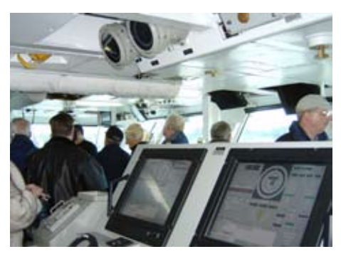
NL enjoys the view from the Bridge while touring the Lincoln. A special treat for new members and guests.