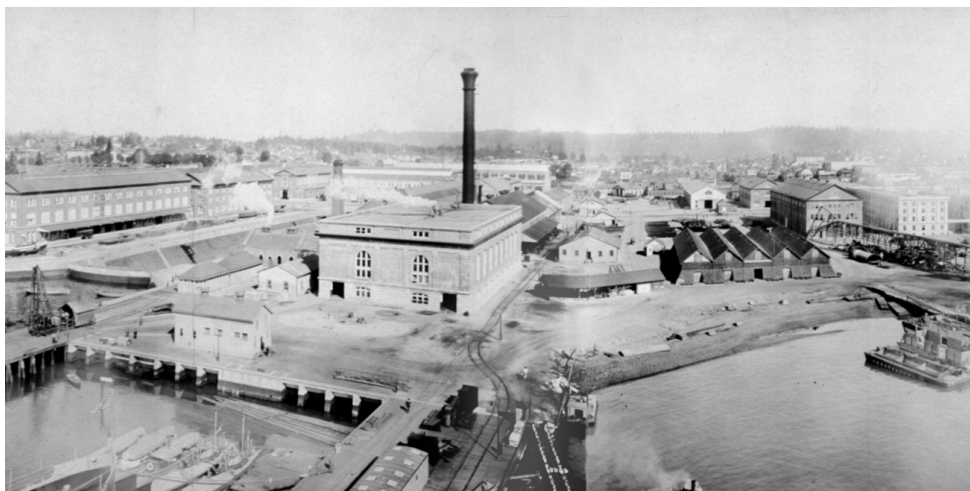
The Puget Sound Naval Shipyard in 1913.