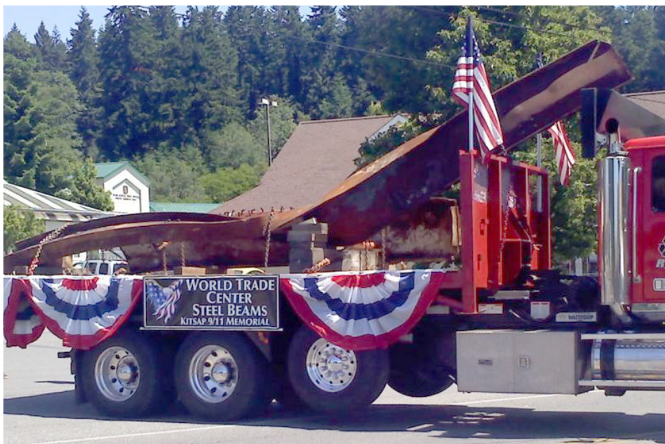
WTC beams arriving in Western Washington

If you have not taken time to walk down to the breakwater at the Bremerton Harbor to see the Lone Sailor up close, plan to do so as soon. It is a great photo opportunity.