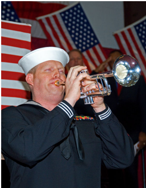
Photos by Ted Moore, Gold Wing Road Riders Motorcycle Club, Chapter "B".