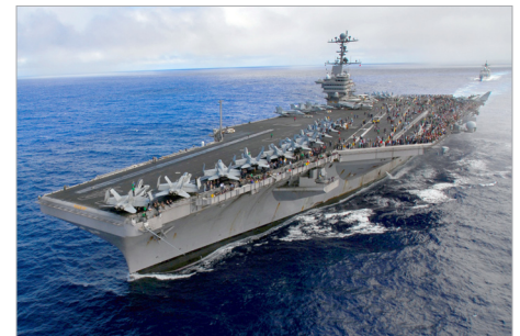
USS John C. Stennis (CVN 74) leads guided-missile cruiser USS Antietam (CG 54) prior to conducting an air power demonstration. The air power demonstration showed the capability of Stennis and Carrier Air Wing 9 to the onboard Tigers. (See insert for more Tiger photos)