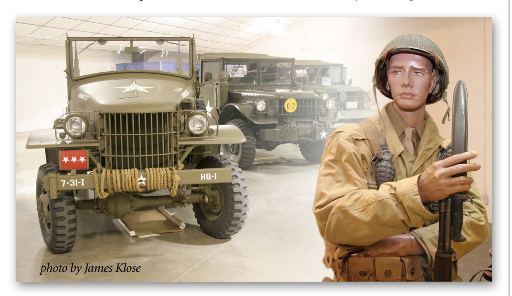
Above: Some of the antique military vehicles/memorabilia on display at the 2005 Veteran's Day Ceremony at the Kitsap Pavilion. These truly unique collections will again be on display this year.

For details of the event, visit the website: www.veteransdayonline.org