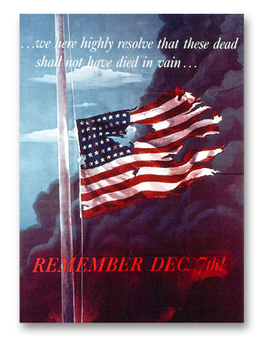
"Lest We Forget. . . Pearl Harbor" Thursday, December 7, 2006 Naval Undersea Museum Auditorium Program Begins at 11:00 a.m. Public invited, Parking free