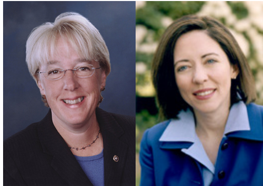
Senator Patty Murray Senator Maria Cantwell

This is a first for Kitsap County! Both Senator Patty Murray and Senator Maria Cantwell will be present at this year's Veterans Day event. The event will be held on Monday, November 12th, in the Kitsap