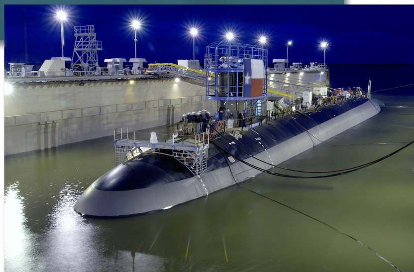
Top: Artist's rendering of a Virginia Class Submarine firing a MK48 Torpedo. Bottom: The floating dry dock holding Texas slowly fills with water before the submarine is launched into the James River on April 9. Once in the water, tugboats moved Texas to Northrop Grumman shipyard's submarine pier, where final outfitting and testing will take place.