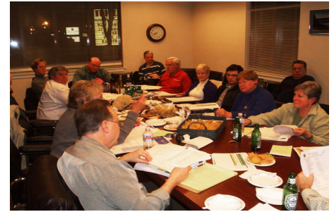
Board members get down to business