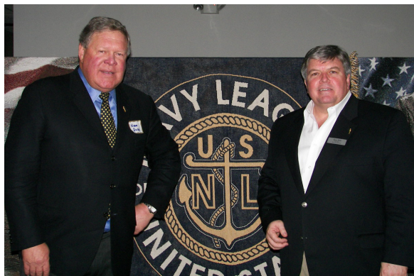
Congressman Norm Dicks D-WA 6th Congressional District http://www.house.gov/dicks/ and Navy League of the United States Bremerton-Olympic Peninsula Council President Guy Stitt stand in front of "throws" display of the Navy League and the Lone Sailor.

Washington's 6th Congressional District Congressman, the Honorable Norm Dicks, and Bremerton Mayor Cary