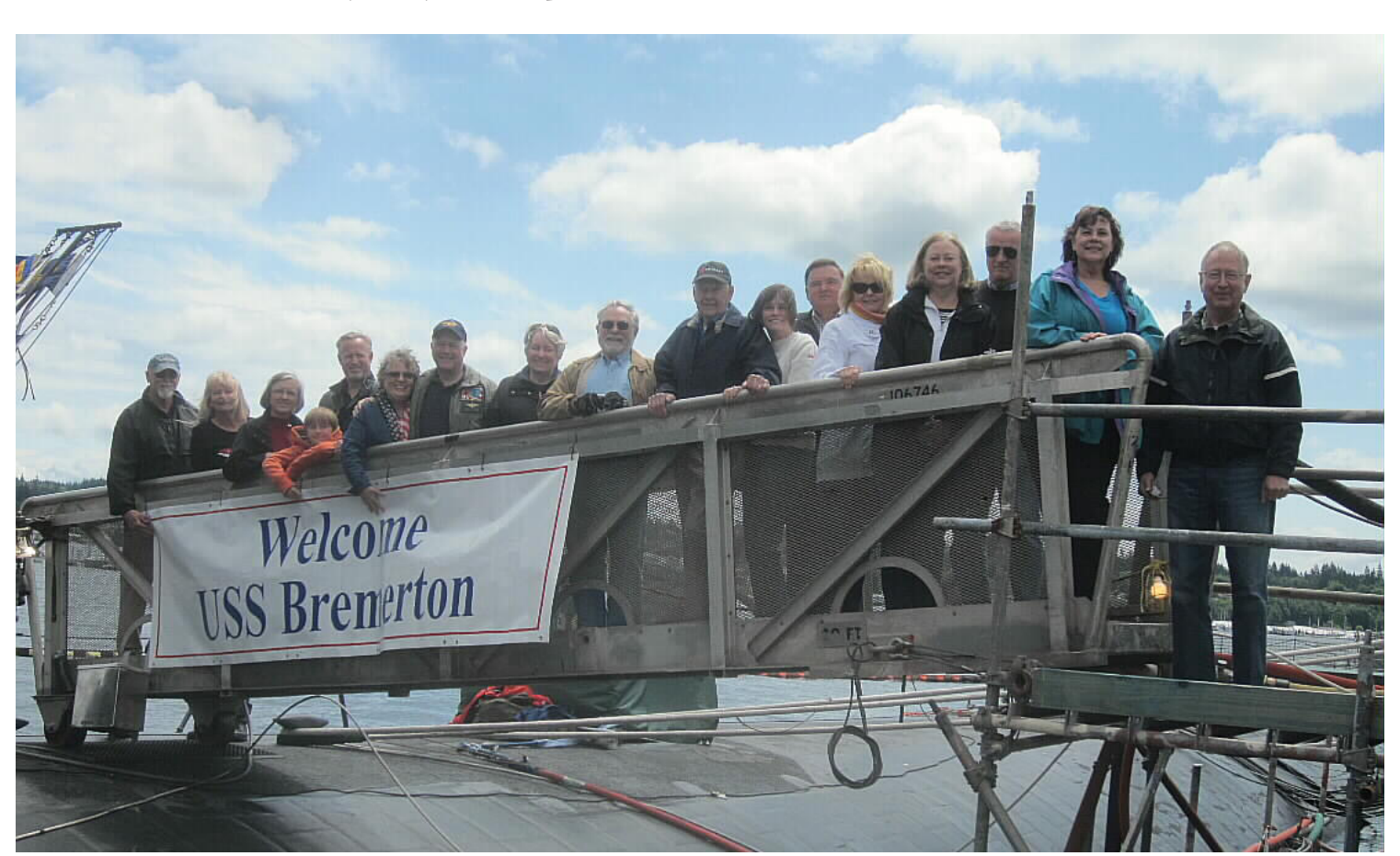
Above: Navy League members and friends enjoying the USS Bremerton tour.