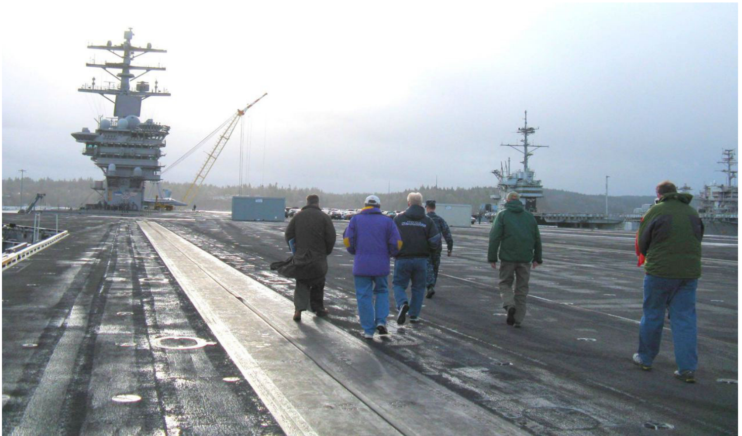
Navy Leaguers onboard the flight deck of USS Stennis

Her telephone number is 360 373-1035 x221. Her office is right on the Boardwalk at 120 Washington Beach in Bremerton.