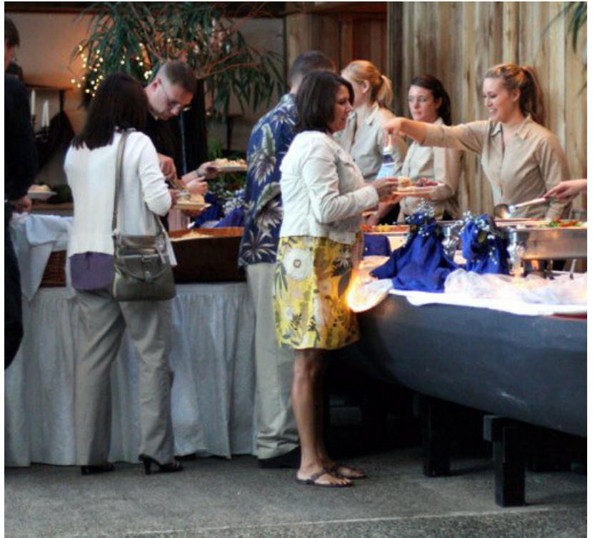
Local Senior Enlisted members and their spouses enjoy a traditional salmon bake provided by the Suquamish Tribe at Kiana lodge.