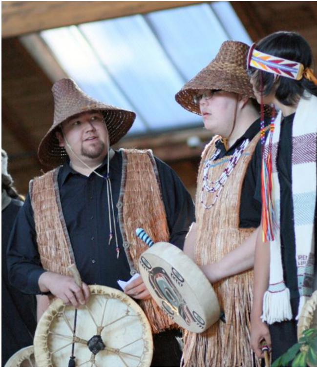
We were delighted and honored by the singing of men and women from the Suquamish Tribe. We are already looking forward to next year.