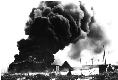
Burning oil tanks on Sand Island, Midway, following the Japanese air attack