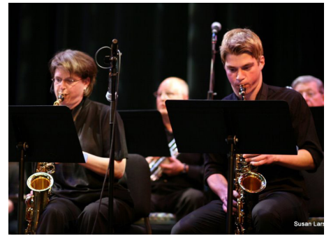
Swing Fever's 12 piece band provided great music for the Navy League Gala participants.