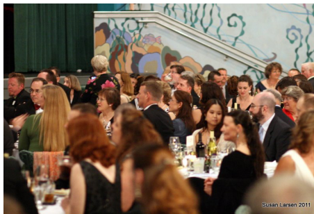
This year we were delighted to host and honor more than 160 military and their spouses at our annual Gala held at the Admiral Theatre in downtown Bremerton.