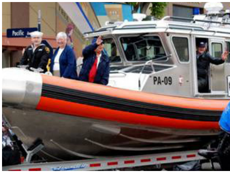
Board members and a Sea Cadet ride a SAFEBOAT in the 63rd Armed Forces Festival Parade with more than 20,000 people celebrating our military.