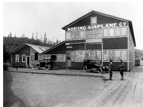
The Red Barn during World War I and how it looks today.