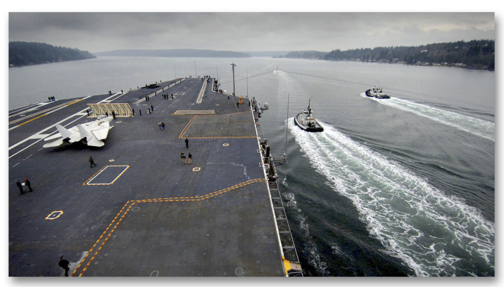
Tugboats steam alongside the Nimitz-class aircraft carrier USS John C. Stennis (CVN 74), as the nuclearpowered ship departs its homeport. Stennis is undergoing sea trials after an 11-month overhaul at the Puget Sound Naval Shipyard.

Stennis began its shipyard availability in January 2005 after a successful five-month deployment to the northern and western Pacific Ocean in 2004 and a change of homeport from San Diego.