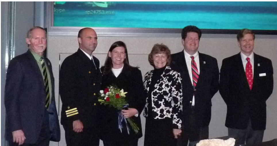
Mayor Lent and City Council members