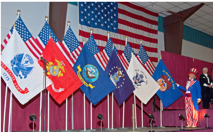
Uncle Sam admires LeMoyné Jevne's flag display at the Veterans Day Program.