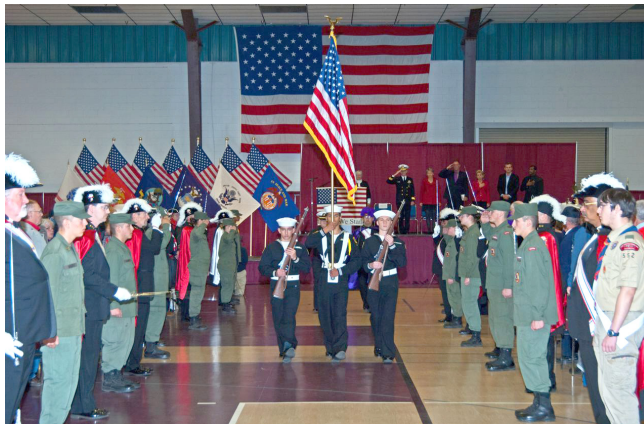
Kitsap Battalion Sea Cadets join with the Knights of Columbus and the Washington Youth Academy in Parading the Colors at our Veterans Day program.

The photos help tell the story of the day as over 1400 people participated in the event.