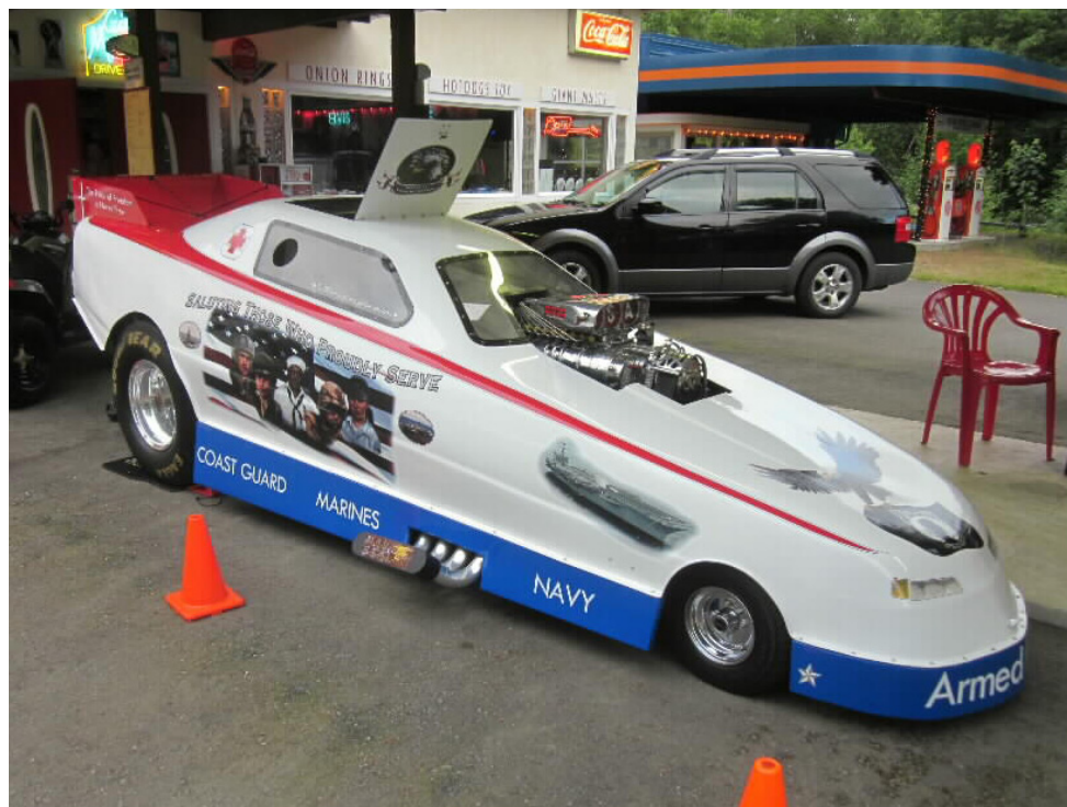
Racing Car from the My Girl Museum in Kingston