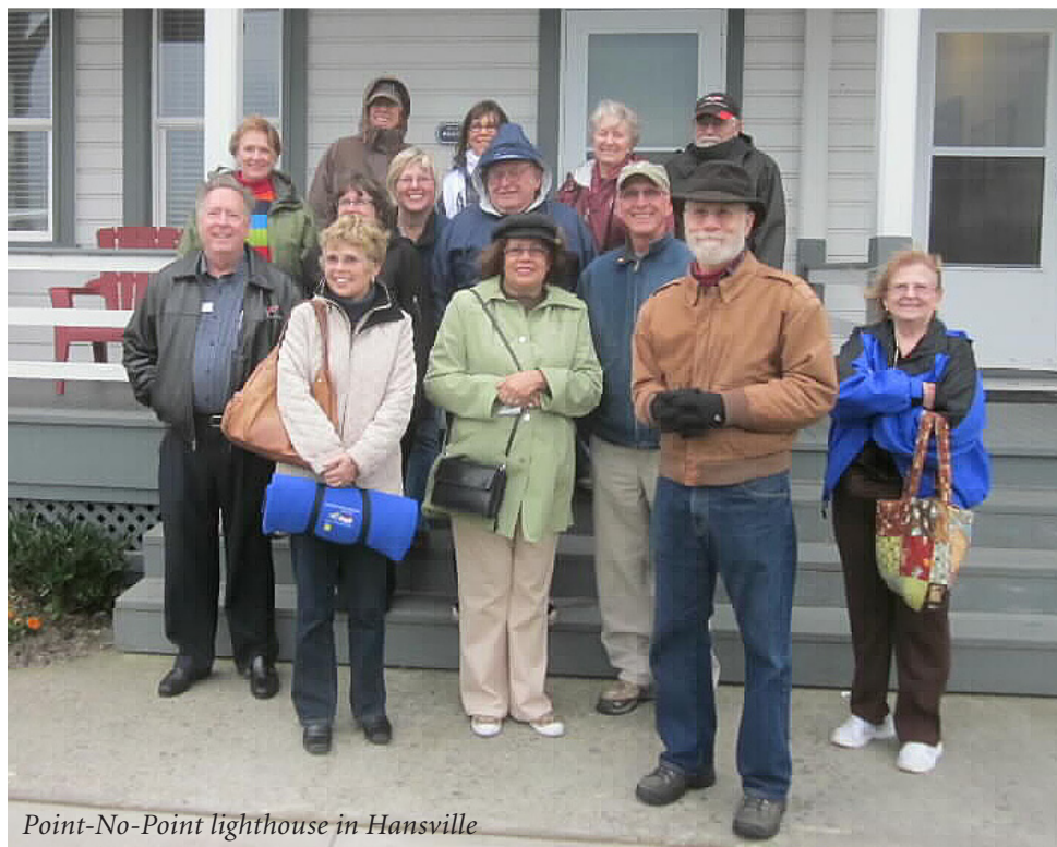
Point-No-Point lighthouse in Hansville