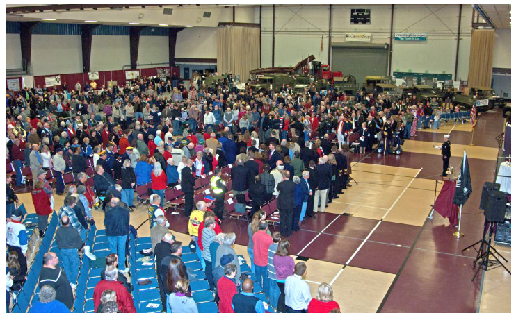
Hundreds turn out to honor our veterans at the Kitsap Sun Pavilion Fairgrounds on Veterans Day.