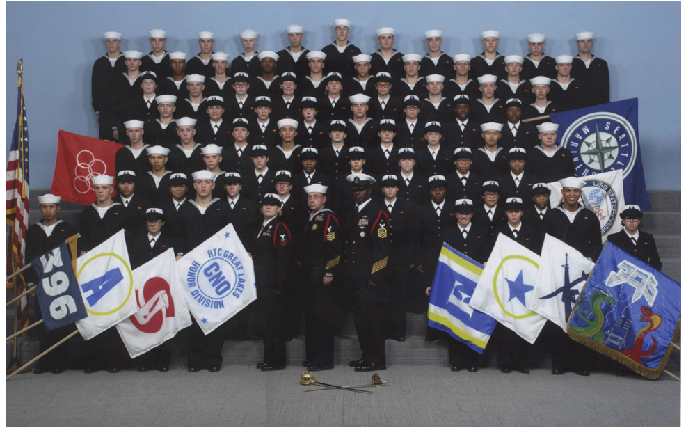
Recruit Training Command's "Inaugural Mariner Company"

On October 19, 2008 at Recruit Training Command in Great Lakes, IL 88 Sailors from NRD Seattle's "Inaugural Mariner Company" graduated from Bootcamp. These 88 Sailors were now formally known as the inaugural "Mariner Company." The Company spent the next seven weeks training from civilian to Sailor under the watchful eye of their Recruit Division Commanders. Training included: formal classroom instruction, airplane, helicopter and ship identification, Basic Damage Control, Seamanship, Naval History, and of course Navy Core Values - Honor Courage and Commitment.