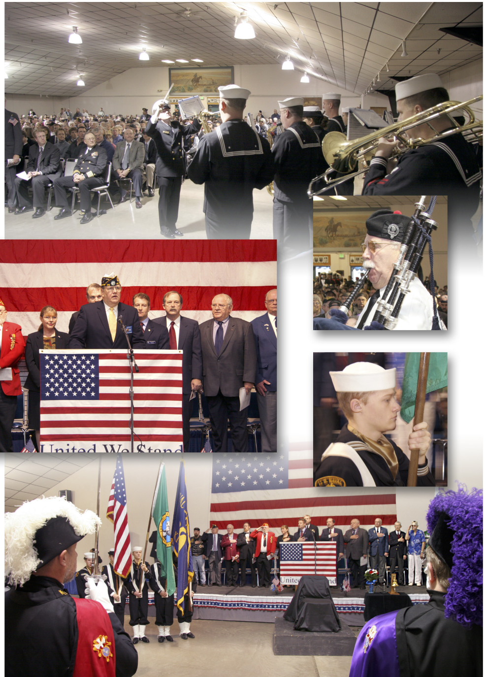
The Veterans Day Program at the Kitsap County Fairgrounds Nov. 11th, welcomed an audience of more than 700 people with 25 veteran and fraternal organizations represented.