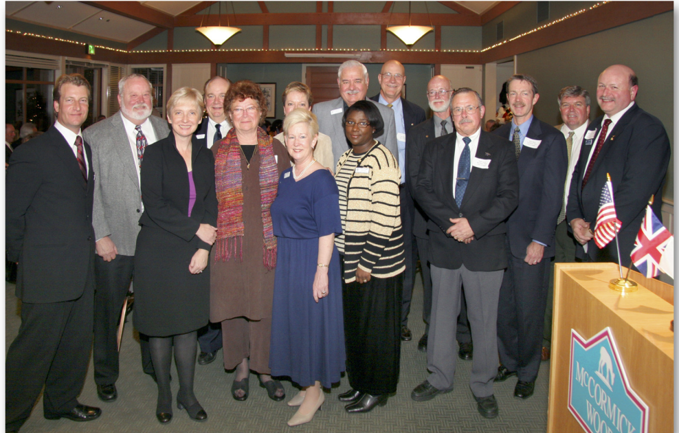
The newly elected 2006 Council Officers and Board Members in attendance at the Trafalgar Night Dinner at Mary Mac's Restaurant, October 27st.