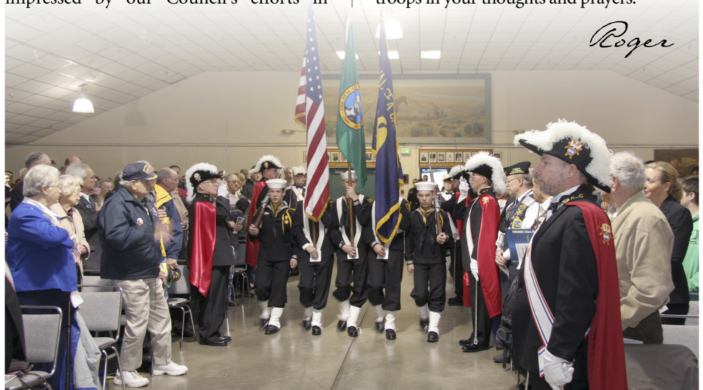
The Presentation of the Colors opening the Veterans Day Program at the Kitsap County Fairgrounds Nov. 11th.