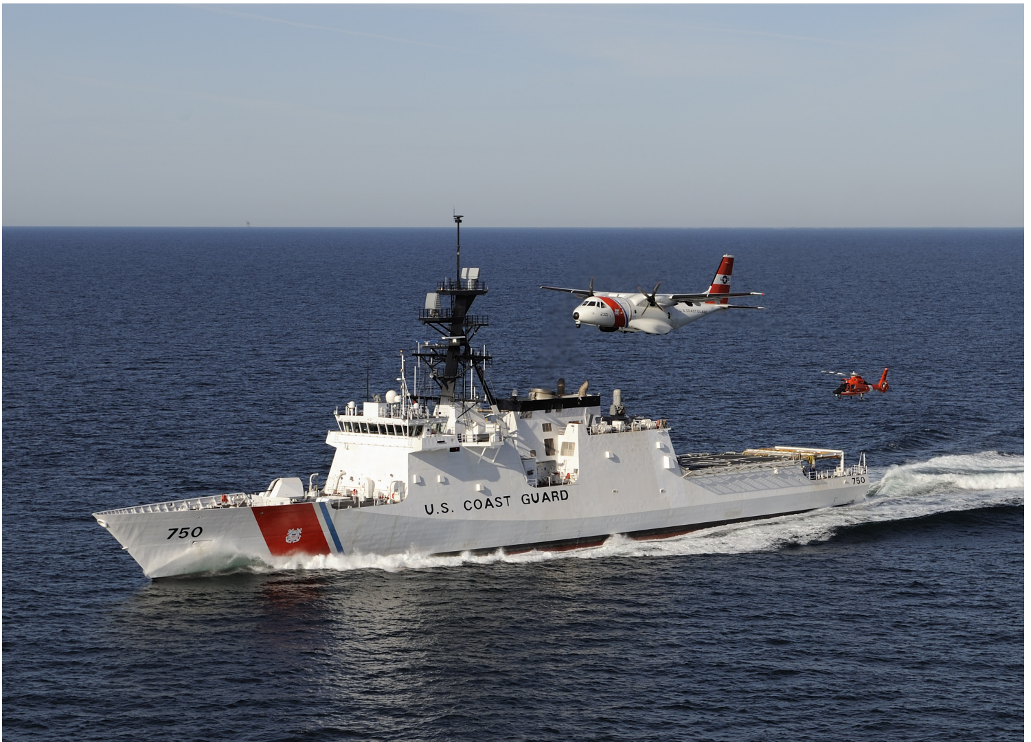
USCGC BERTHOLF operating in concert with the services new maritime patrol aircraft, the Ocean Sentry HC-144 and a newly re-engined HC-65 helicopter.