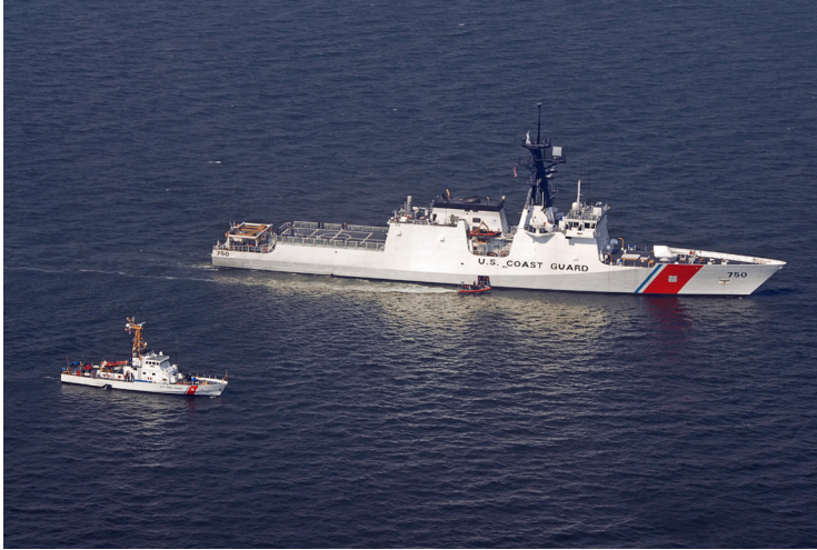
USCGC STATEN ISLAND and the USCGC BERTHOLF