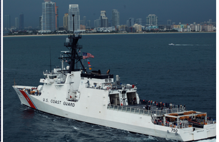
USCGC BERTHOLF showing the two helicopter hangers and rear launch ramp door.