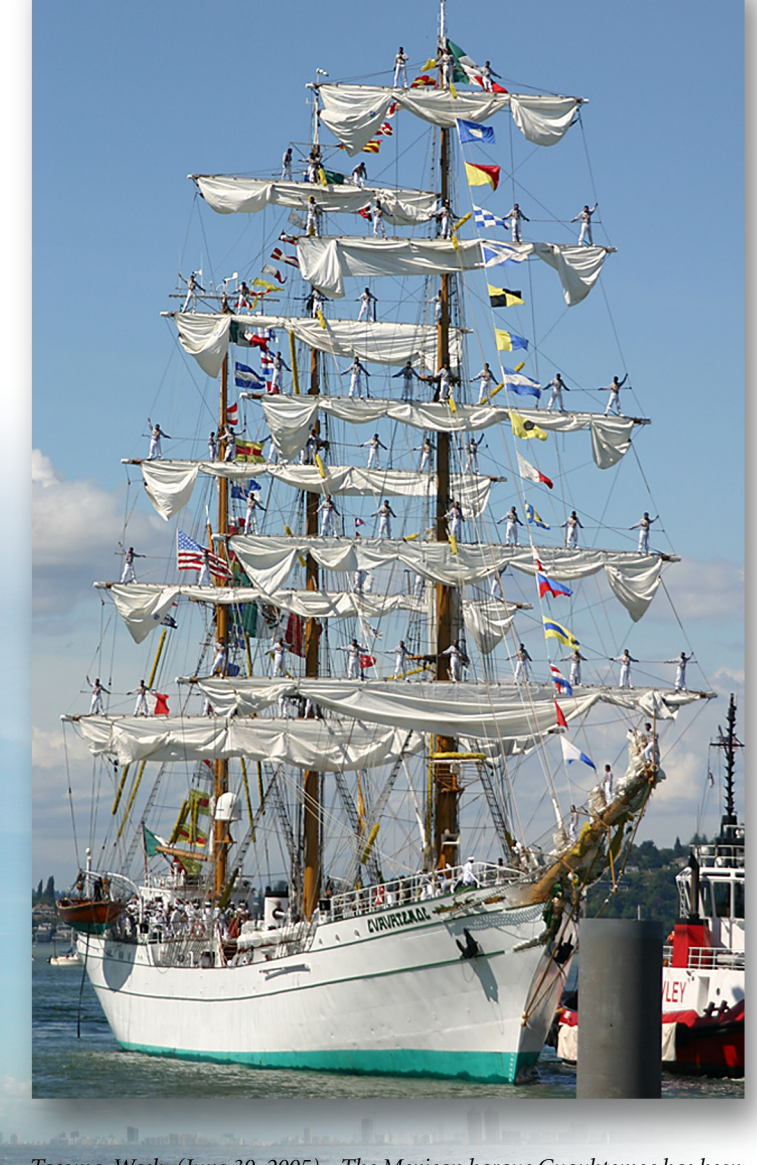
Tacoma, Wash. (June 30, 2005) - The Mexican barque Cuauhtemoc has been home to more than 21 generations of Mexican naval officers. Cuauhtemoc was one of about 30 sailing ships, which moored on Tacoma's Thea Foss Waterway for the Tacoma Tall Ships 2005 festival.