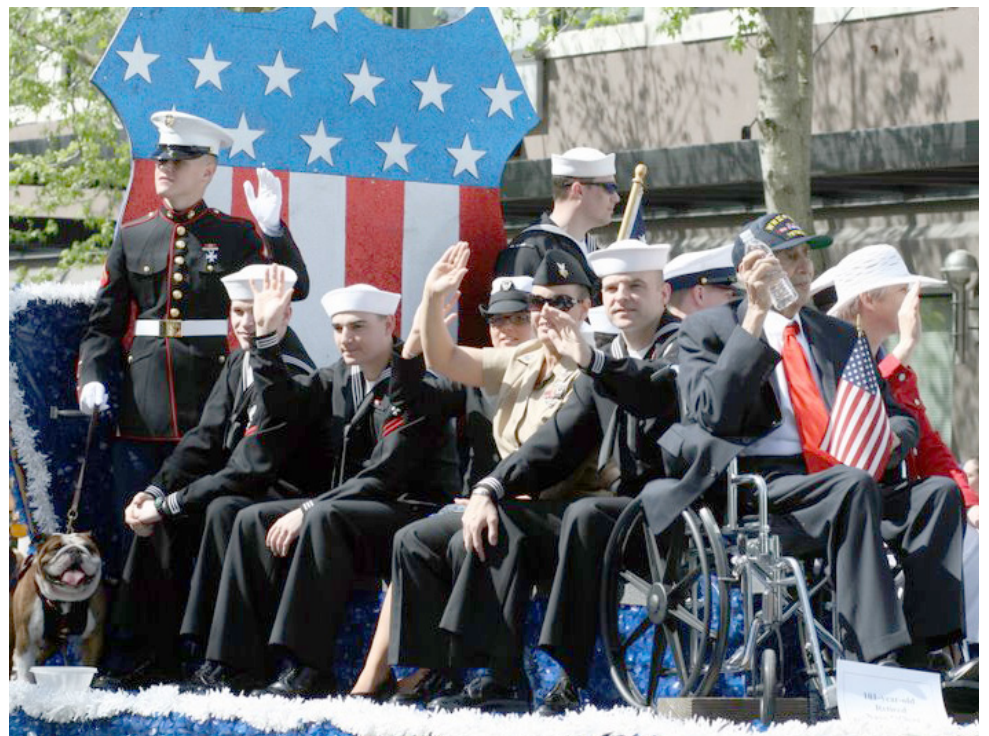
Waving to the crowd at the Armed Forces Day Parade

Thanks to all of the sponsors and to the members of the Military Affairs Committee who work on this event all year long in honor of our military.