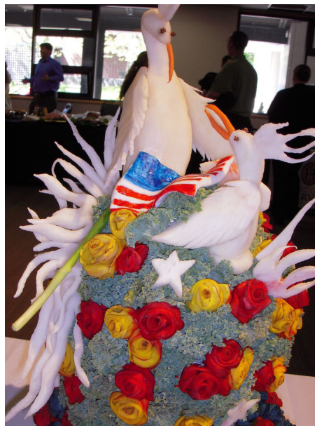
Armed Forces Festival Activities. Military Chefs Competition on May 14, 10 am to 2 pm at Olympic College