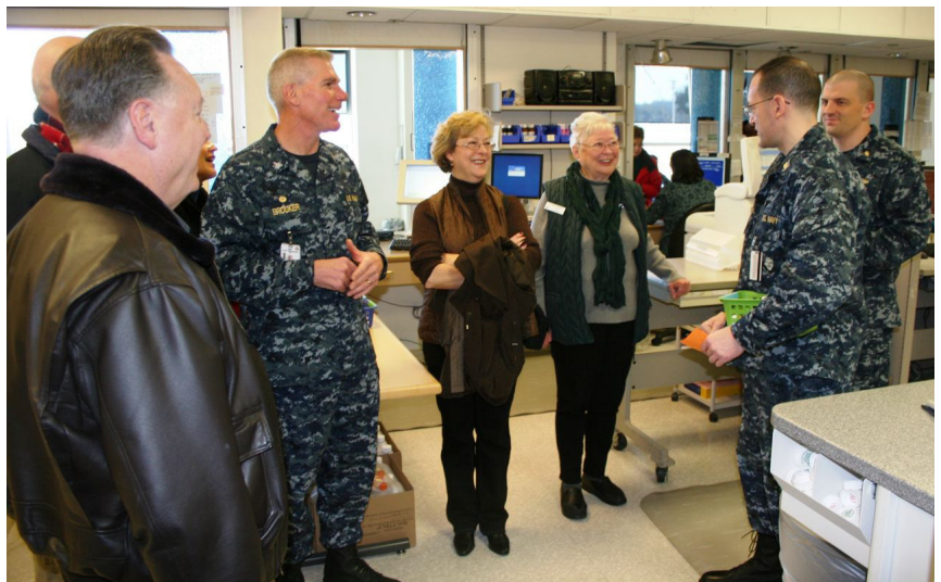
NHB Tour group is thoroughly enjoying hearing the stories of these fine young men as we tour the hospital