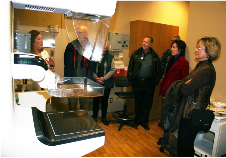
NHB Tour group getting briefed on the newest state-of-the-art mammography machine in the Puget Sound area