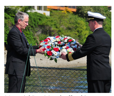
Memorial Day Wreath offered in 2009

Respectfully submitted, Gary S Gunderson