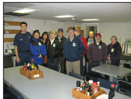
Navy League members and guests enjoy the hospitality of the McArthur 2 and the Okeanus Explorer in Seattle on March 14th