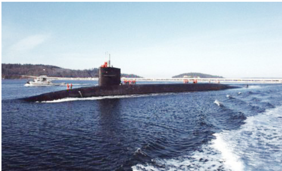
The USS Ohio (SSBN-726), just having passed through the Hood's Canal floating bridge and heading south, circa late 1980's.